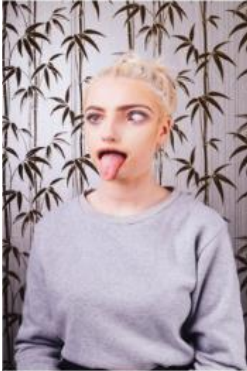
Photo montage using Photoshop manipulation