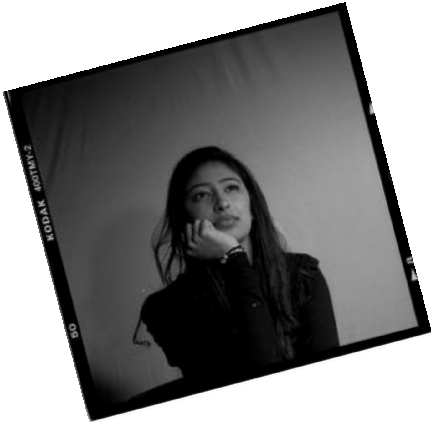
Portraiture using film