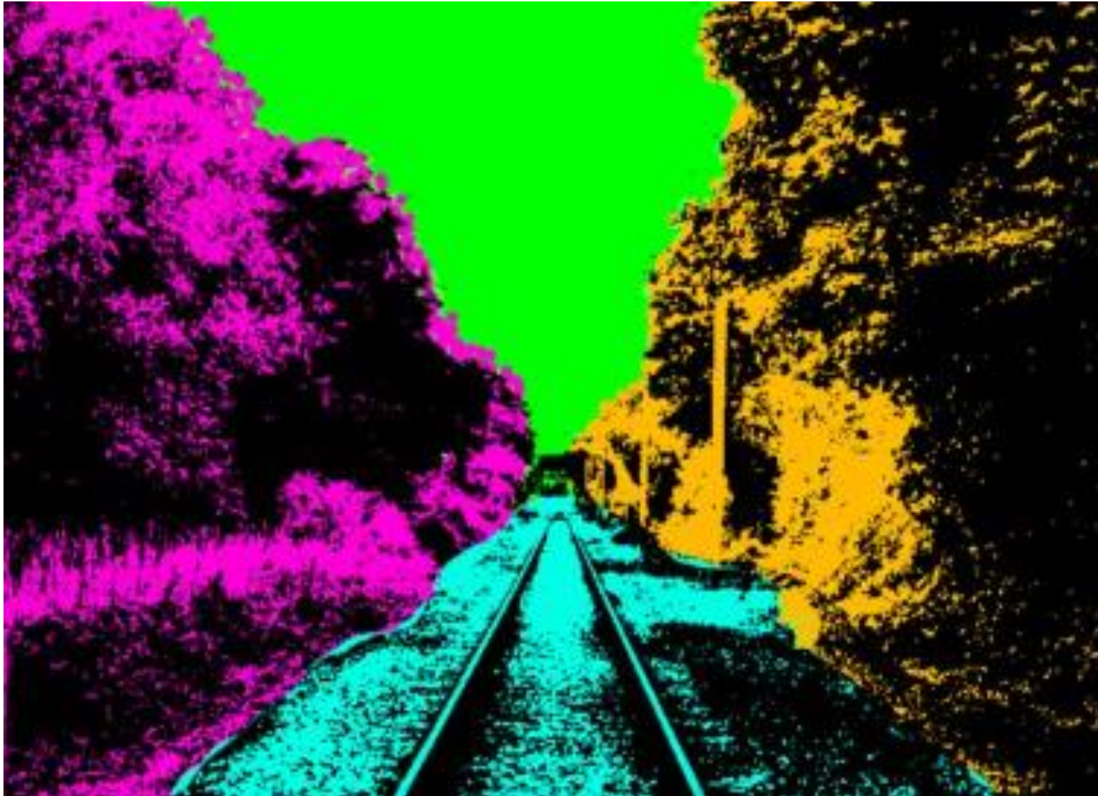
Andy Warhol inspired Landscape