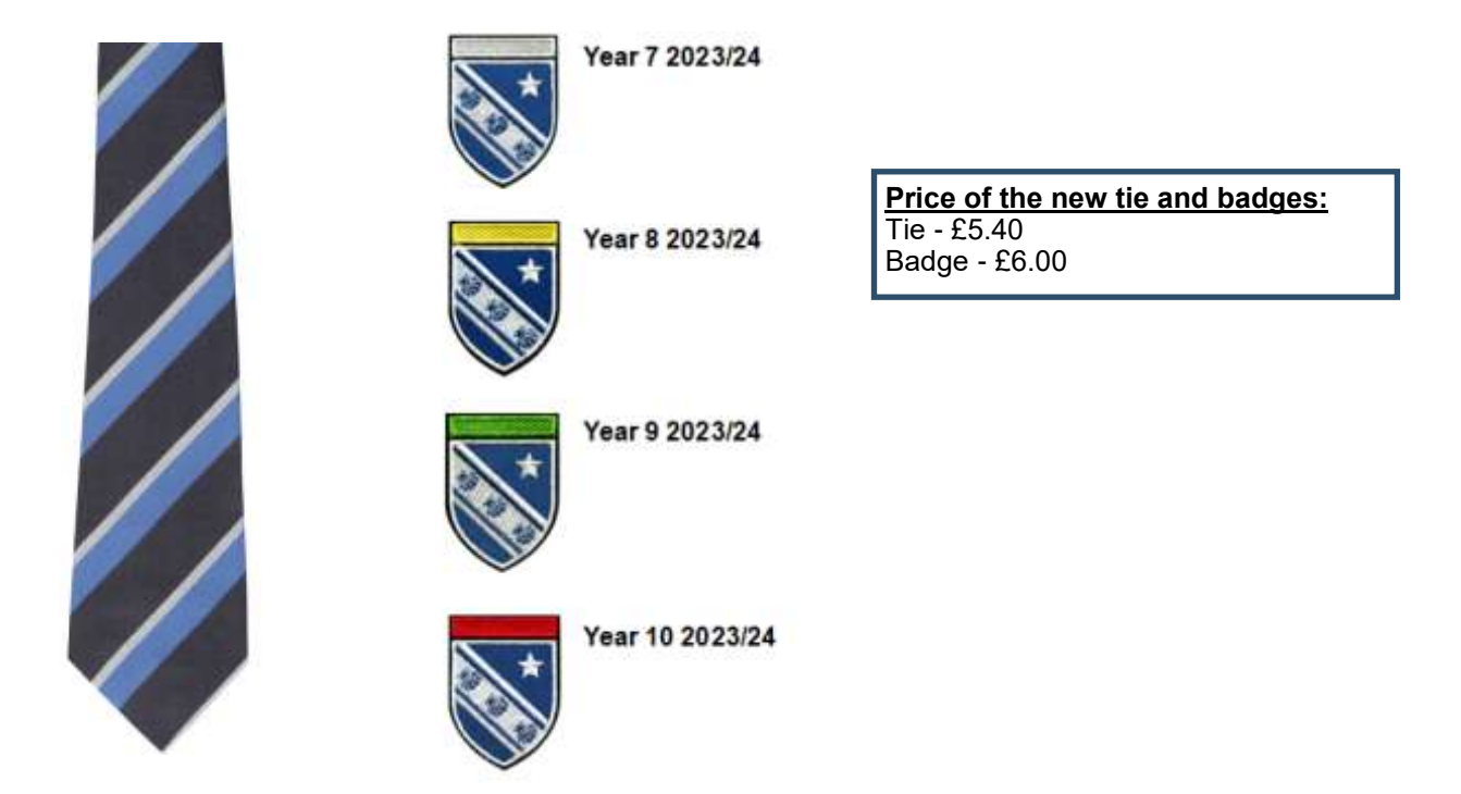
Year 11's Sept 2023 will maintain the current House badges and ties, with any replacements at just £2. This is to minimise the need to change for just 2 ½ terms before the end of the academic year and of course to reduce cost. The girls can also wear their house ties if they choose to.

The new tie and relevant colours of badges for year groups from September 2023 are as below: