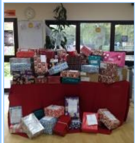
Romania Christmas Boxes