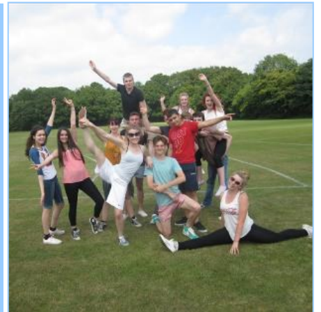
Horizons' Sports Day

Year 12 culminates in 8 days of 'Horizons' which involves key skill development and finally a week of work placement which is almost a compulsory element of job and University applications in today's society.