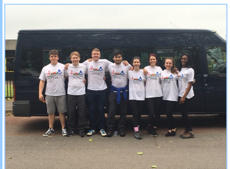
3 peaks challenge