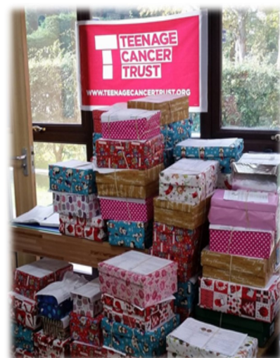
Supporting our chosen Charities