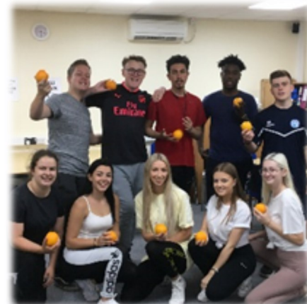
Horizons' Sports Day

Year 12 culminates in 5 days of 'Horizons' which involves key skill development and finally a week of work placement which is almost a compulsory element of job and university applications in today's society.