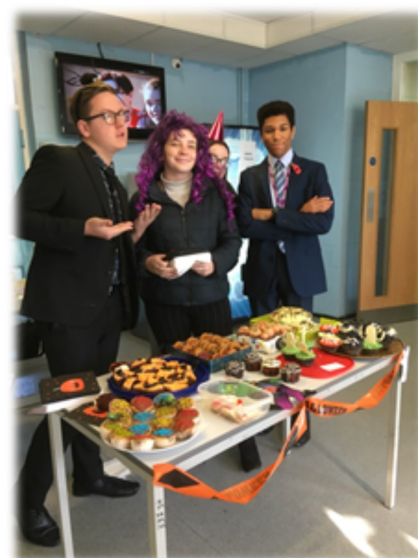
Halloween cake baking competition